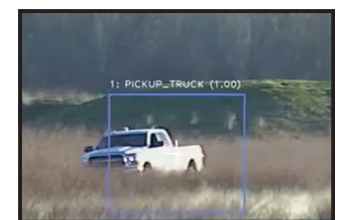
From guns and drones to virtually any object, Exigent can be trained for automatic detection, identification and alerts.